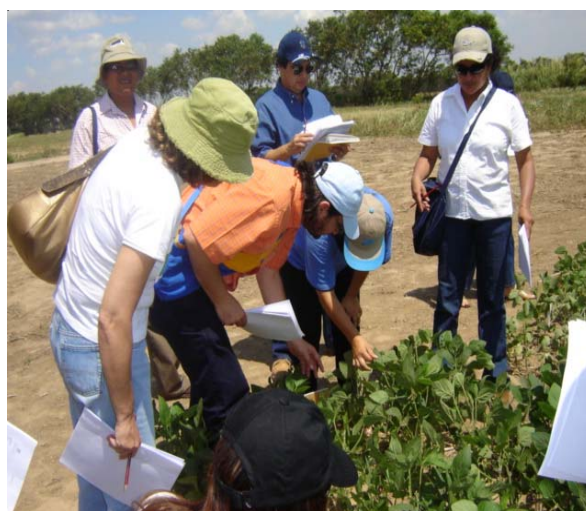
Participants recording data from soybean plots in the field test exercise